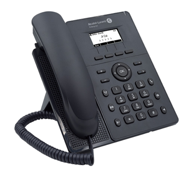
Alcatel Lucent H2P