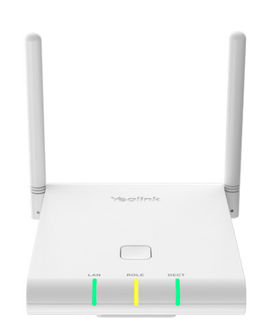
DECT IP Multi-Cell Base Station W90DM