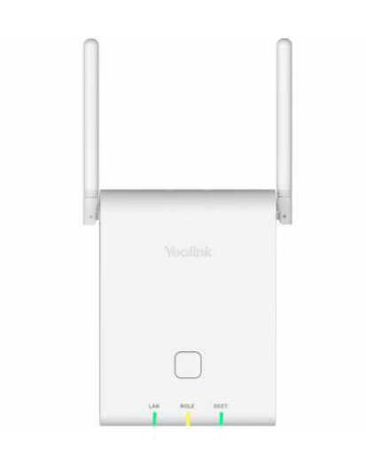
DECT IP Multi-Cell Base Station W90B