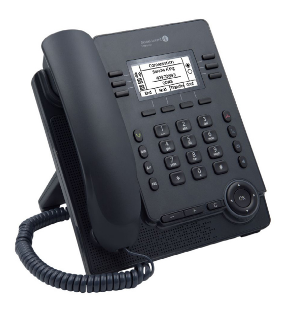
Alcatel Lucent M3