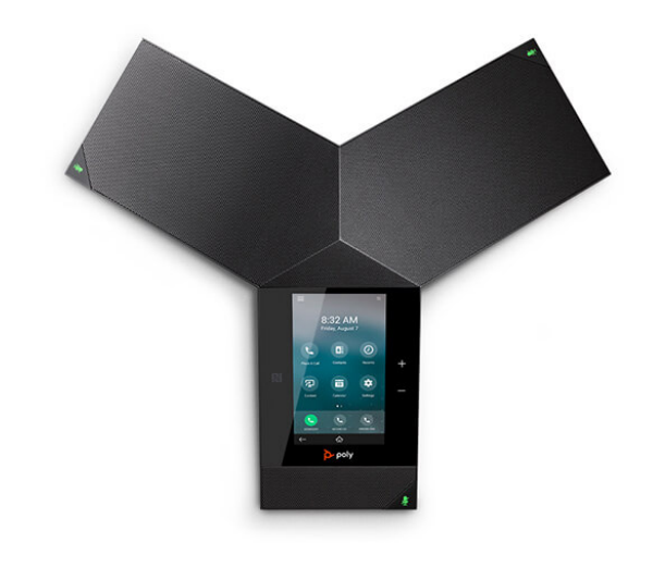
Poly Trio 8300 Conference Phone