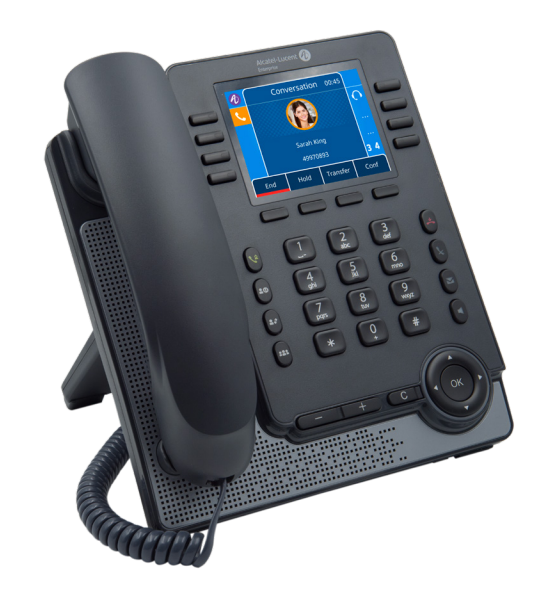
Alcatel Lucent M7