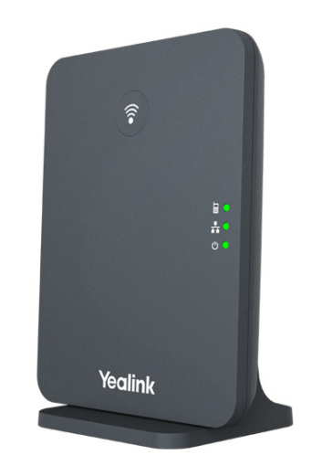
Yealink DECT IP Base Station W70B